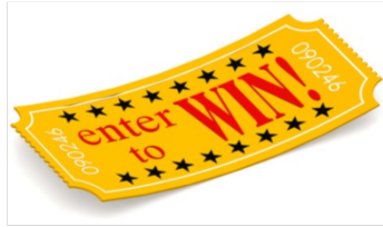
EXHIBIT HALL THURSDAY FROM 7:30 AM TO 4:30 PM

REFRESHMENTS AVAILABLE DURING MORNING AND AFTERNOON SESSION BREAKS